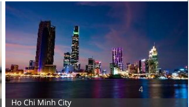
Ho Chi Minh City